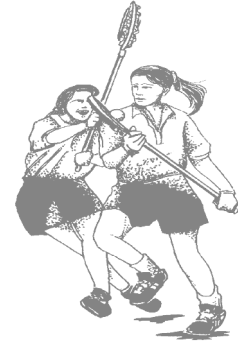
Sponsor of the "Byrne Cup" Twin State All-Star Games